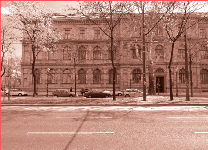
The Ferstel wing on Stubenring / Oskar-Kokoschka-Platz