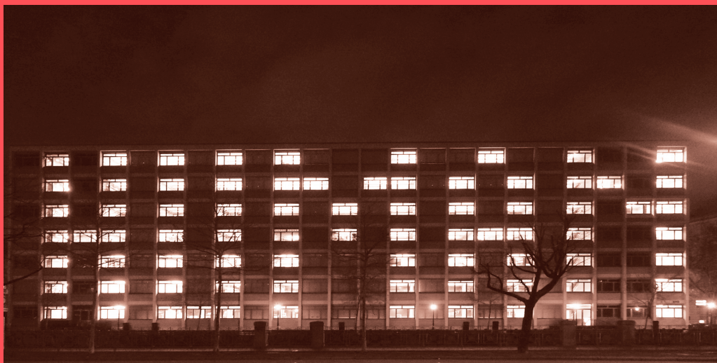
Light art signal Human 2019, installation view of the interaction series HUMAN