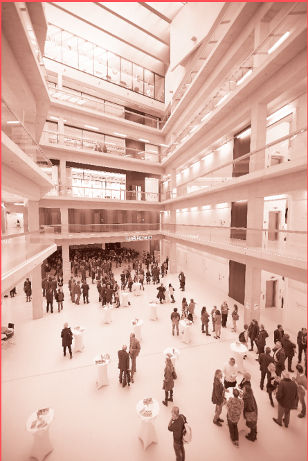
The building VZA7 at Vordere Zollamtsstraße © Birgit and Peter Kainz