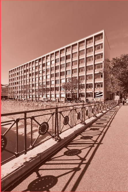
The Schwanzer wing at Oskar-Kokoschka-Platz